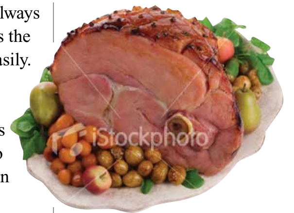
The most requested dish at Arbor Ridge is baked ham.